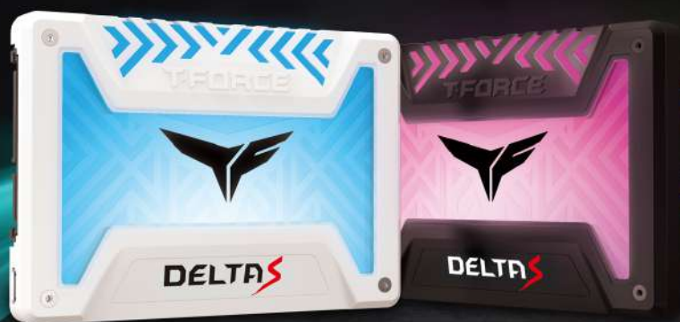
DELTA S RGB SSD(12V)